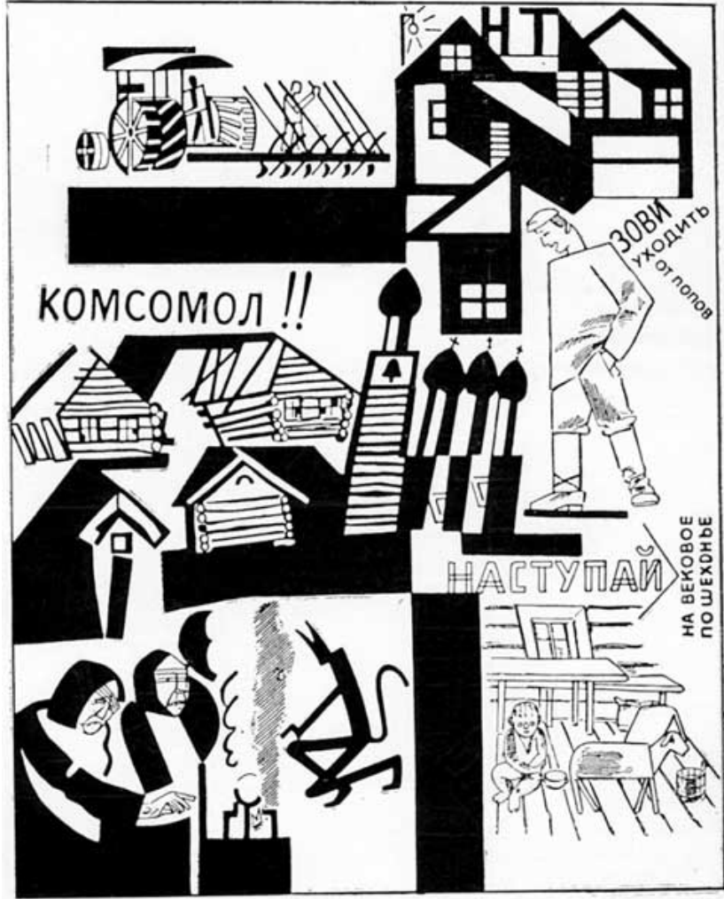
The NEW ERA is upon us! WE MUST BUILD for the FUTURE!