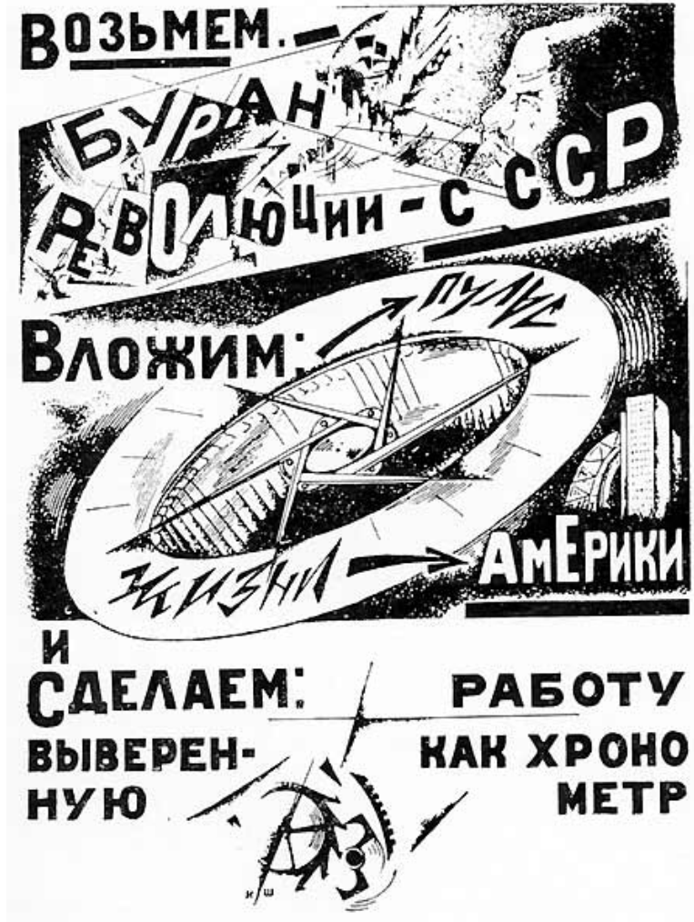
Aaaahahah! SCIENCE and INDUSTRY are your new gods! YOU must RUN like CLOCKWORK!