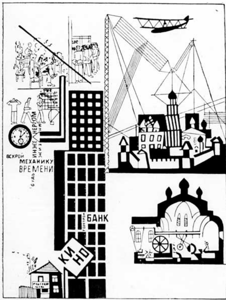
Muahahaha.... YESSSS!!! YESSSSSSSS!!!! Transform the churches into ENGINEERING STRONGHOLDS!!!!